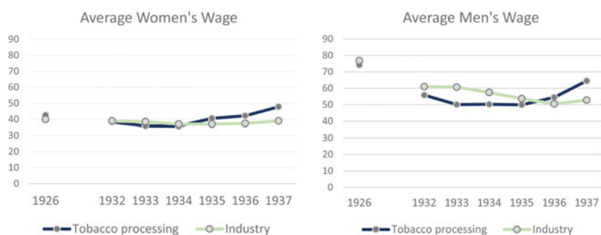
Graph 2. Men's and women's wages in the Bulgarian tobacco industry in comparison with the average industrial wage (levs per day). 31

a consequence of the collective agreements, but to a lesser extent than men's wages (see Graph 2). Thus, following the introduction of the tonga system in the early 1930s, the gender pay gap in the Bulgarian tobacco industry narrowed significantly: In 1926, women tobacco workers earned, on average, 57.33 percent of a man's wage, while in 1932 it was 68.48 percent. The gender pay gap was smallest just before the introduction of the industry-wide collective agreements in 1935, when women earned an average of 81.25 percent of men's wages. After 1937, the gender pay gap increased to around 74–77 percent (see Graphs 1 and 2).